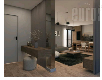
KUHINJA I DNEVNA SOBA