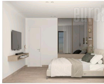
SPAVAĆA SOBA I