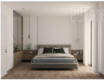
SPAVAĆA SOBA I